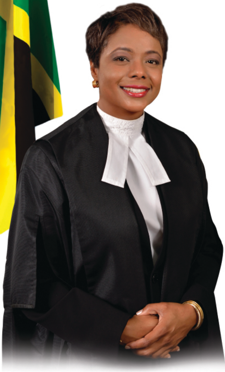
Hon. Marlene Malahoo Forte, QC, MP Attorney General of Jamaica